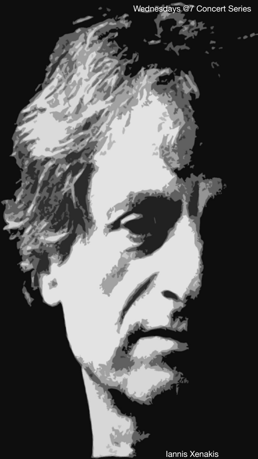
Iannis Xenakis 1922-2001